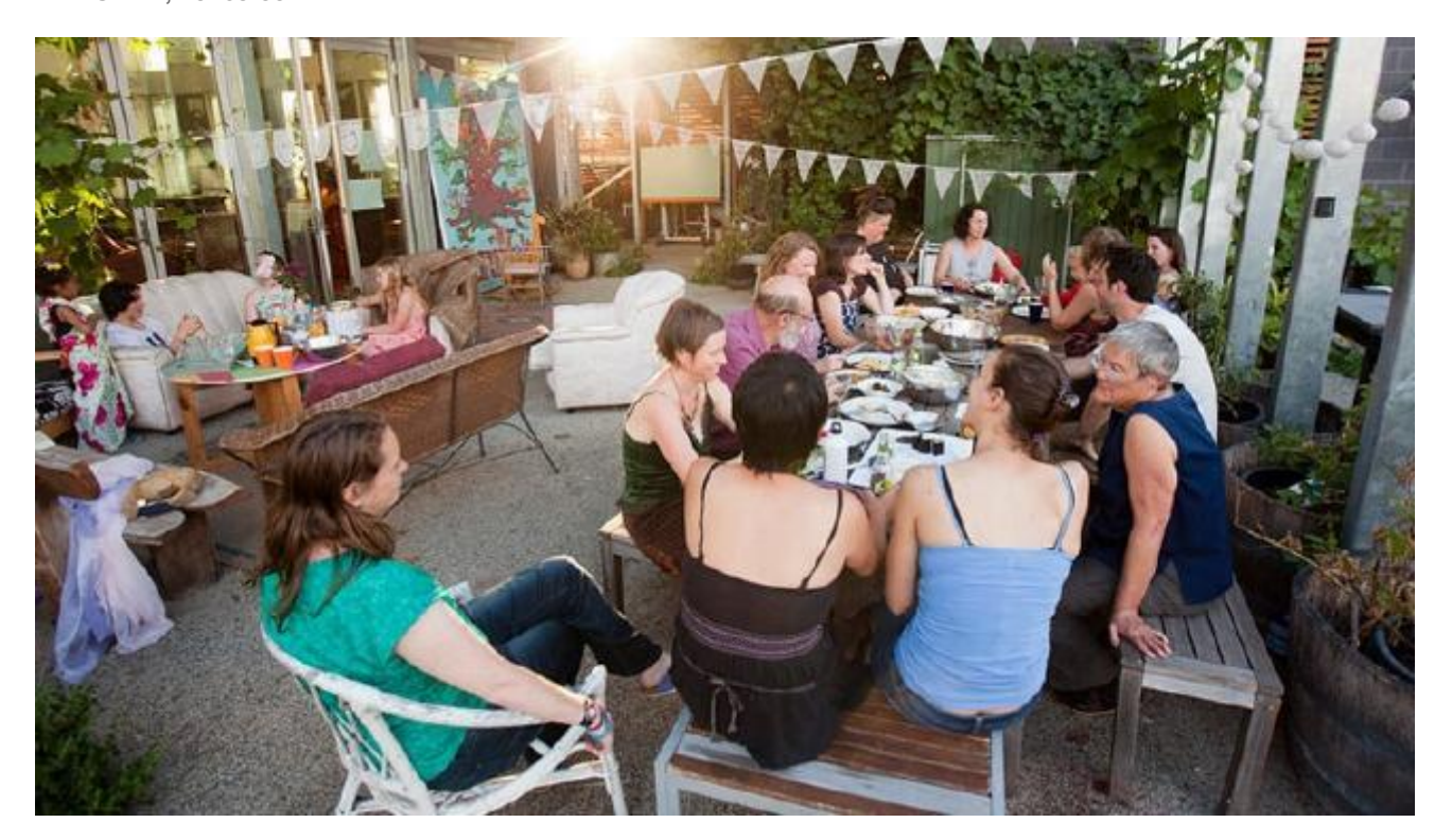
Like your neighbours? Could you live with them? Pictured: Members of Murundaka Co-housing Community in Melbourne.